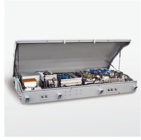
Vossloh Kiepe roof-mounted equipment enclosure DGG 343

The low-floor trolley bus design is made possible by the compact Vossloh Kiepe roof-mounted equipment enclosure. This container is easily accessible for maintenance and safely protected in the event of traffic accidents. The aluminium housing includes the most important electronic units for the traction and the on-board power supply, and has been designed to facilitate rapid replacement of key modules, thus ensuring the highest degree of vehicle availability. The modern technology also offers ABS and TCS as well as a vehicle roll-back protection and allows powerful driving up to an electronically limited maximum speed of 70 km/h (43 mph).